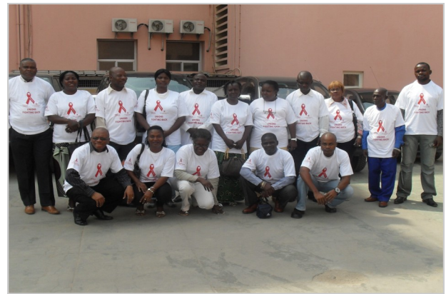
Participants attending the In-country seminar in Angola and Deputy Minister of Health (in the middle picture at the bottom)

* The creation of the Commission for the fight against AIDS which