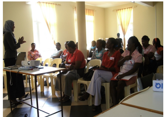
Women's workshop in Rodrigues

Different organizations the world over will be campaigning against gender based violence from the 25th of November - 10th of December 2010.