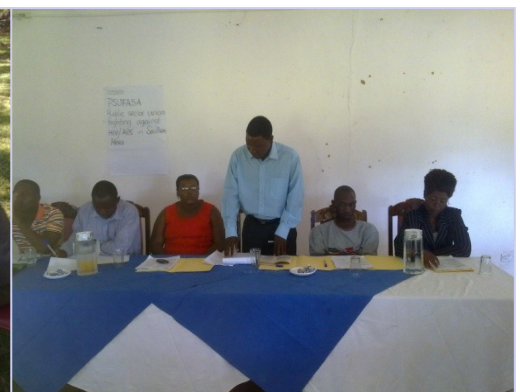
ZRDCWU union activists dissecting the draft policy during the consultative workshop

and other preventative measures. In order to ensure the implementation of the policy, union activists further recommended a number of activities that the union should implement such as ensuring