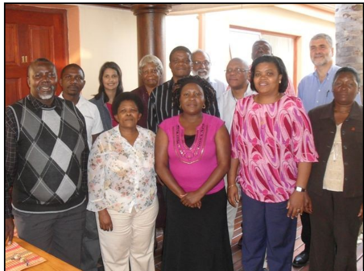
Project Board members, September, 2010

The Project Secretariat is still consulting unions concerning their future capacity building needs in relation to HIV and AIDS. It is hoped that this consultation process will lead to the development of union driven activities.